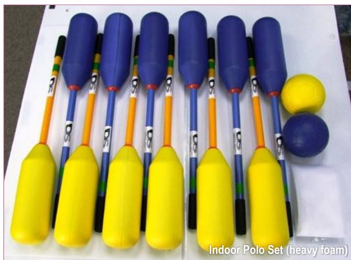
Indoor Polo Set (heavy foam)